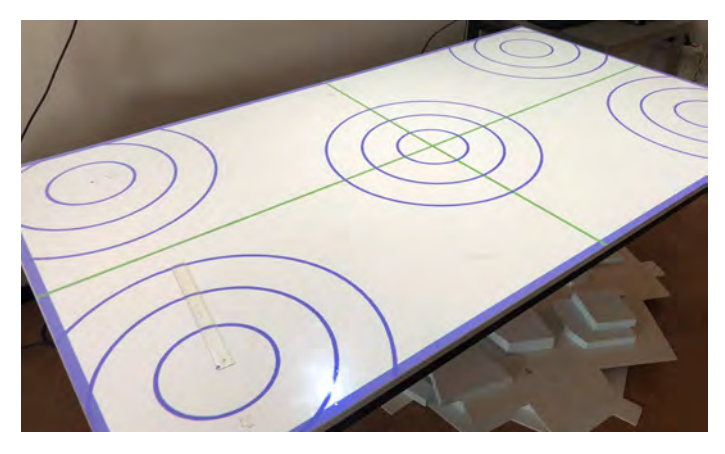
Fig. 2. Calibration of the AR table.

Calibration. The first step in realizing such a table is the calibration of the system, which aligns the camera space (i.e., the space of the table that is visible to the camera for tracking) with the projector space (i.e., the part of the simulation that is projected onto the table), and the simulation space (i.e., the 3D environment running the simulation on the computer). We are using a standard approach that detects the corners of the table to define the camera space. The projector space is determined by recursive line drawing, and both spaces are mapped using OpenCV's wrapPerspective function (see Fig. 2).