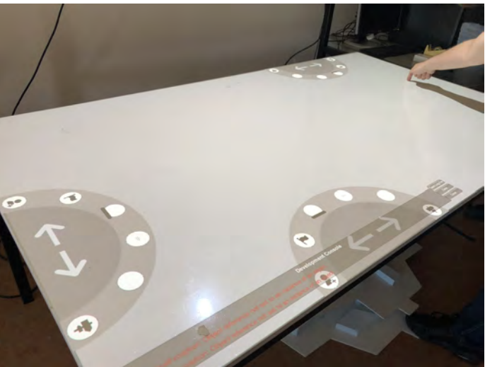
Fig. 5. Table top interfaces to control the simulation.

control and modify the actual simulation (e.g., change number or speed of spawning crowds, define start and target areas).