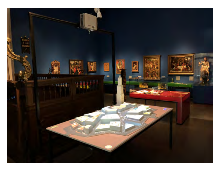
Fig. 1. AR table installation with data projector and video camera on the ceiling and projections onto a fixed city model.

Spacial AR projects virtual elements onto reality, thus augmenting it with virtual visuals. Common installations include tables where a data projector is mounted on the ceiling. Fig. 1 shows an example of an earlier demo of our system with a fixed city model. The new installation for the museum uses a mobile setup where people can place obstacles and other objects, both real and digital, onto the table.