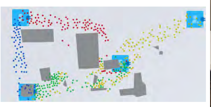
Fig. 3. Contour map of the physical objects placed on the table.

We distinguish between 'fixed objects' that are placed on the table to serve as an obstacle that the simulated crowds have to walk around, and 'dynamic objects', such as the users' hands that are used for interaction. Fixed objects include 3D objects, such as toy blocks, as well as 2D objects, such as obstacles drawn on a piece of paper. The scene on the table is constantly re-evaluated and updated in almost real-time using the 8-bit RGB image, the 16-bit infrared image, and the depth image captured by the camera. Fig. 3 shows a contour map created from the physical objects placed on the table, along with several virtual source and target locations for the crowd simulation. Fig. 4 shows the contours used to create multitouch functionality to enable placing and modifying these (and other) virtual objects and controlling the simulation.