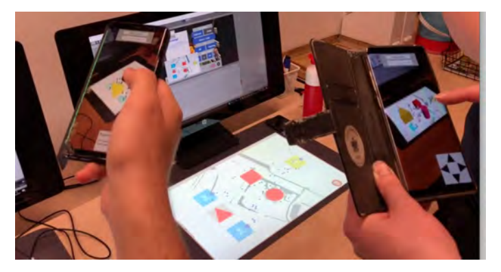
Fig. 6. Two users interacting with the tabletop simulation via the AR app on mobile phones.

We presented a system for accessing, exploring, and manipulating crowd simulations via augmented reality in the context of a museum presentation. The goal of this installation is to teach visitors about crowd simulation and the scientific principles of simulations. The chosen AR concepts are based on our analysis in [3], which resulted in the creation of an interactive AR table, complemented by a handheld AR solution. The table proved to be a viable and promising solution in initial informal user tests and feedback provided by experts from the museum. Our future plans include optimization of