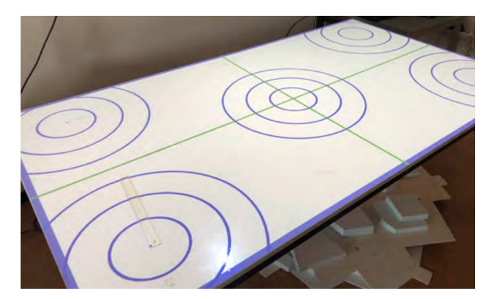
Fig. 2. Result of calibrating the projector.

The setup consists of three distinct parts: A projector, a depth camera and a table. The table has to be white in order to be able to project the largest range of colors and it also has to be a convex quadrilateral in this installation. Our table is approximately 2m by 1m. The projector has a full HD resolution, meaning that each pixel projected on the table has a minimal size of 1mm^2 . The depth camera is the Azure Kinect [10] and the framework also supports the discontinued Kinect