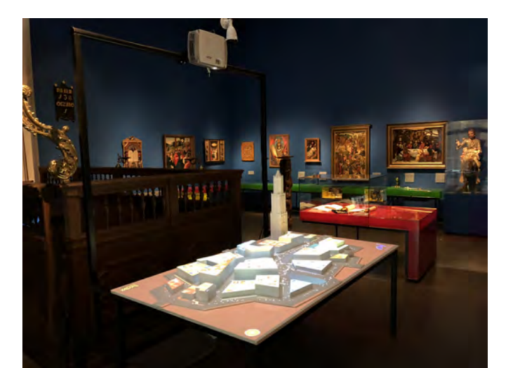
Fig. 1. Example of an AR table installation for crowd simulation.

with a complex simulation. This paper will give an update regarding the development of the CrowdAR table.