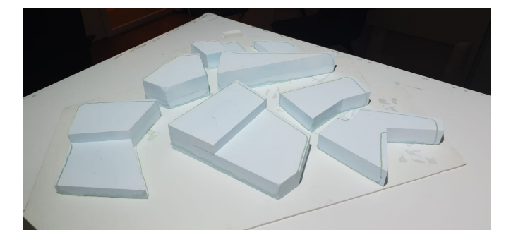
Fig. 4. The contours of the detected blocks are being projected back on the table. The contours are only accurate on ground level due to the lack of projection mapping, which takes the blocks' height into account

level by testing if an object was detected at that place for at least n frames in a row. More frequent updates improve responsiveness, but run a greater risk of showing arms of users or objects that have just stopped moving when this is not intentional.