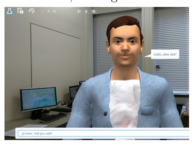
Fig. 2. Open text input box

Our research method is to vary the aspect