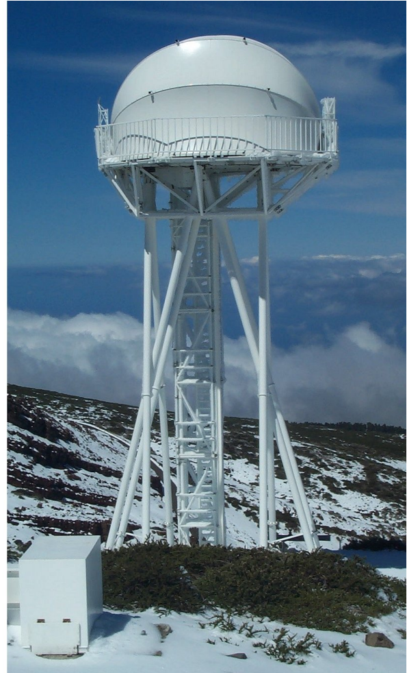
Figure 1: Dutch Open Telescope (DOT) with full fold-down 7 m diameter dome enclosure. Left: enclosure fully open, leaving the telescope in a desired natural wind flow. Right: enclosure closed in winter - note the substantial snow and ice build-up on the ladder and elevator frame work, but not on the dome – it slides off naturally.