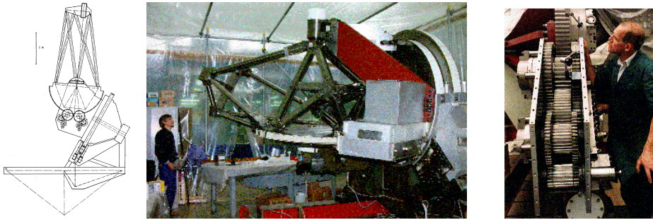
Figure 1. Left: DOT diagram. Middle: the DOT in Delft, with Hammerschlag. Right: technician P.W. Hoogendoorn with one drive train.

The requirement that the telescope should point stably, with accuracy better than its diffraction limit while exposed to strong and gusty winds, has led Hammerschlag to develop novel drives of unparalleled mechanical stiffness. Most of the DOT effort over the past two decades concerned these. Essentially a one-man project for many years that had to rely on tight university funding, the DOT progressed at about the pace of much larger solar telescope projects (THEMIS, LEST). It accelerated when the completion was funded by the Dutch foundation for technical sciences STW. STW also covers the current installation and verification phase.