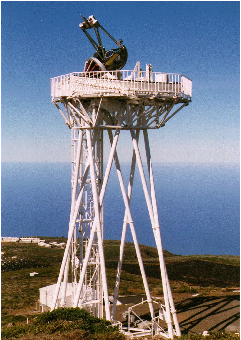
Figure 2. The Dutch Open Telescope on La Palma, December 1997. Altitude about 2300 m. North is to the right, the SVST to the back of the photographer, the Carlsberg transit telescope just below the DOT, the Residencia way down past the black fire mark covering part of the HEGRA array. The Atlantic spreads to the far horizon.