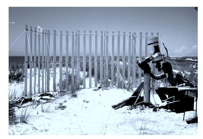
Figure 2. Zwaan site testing on Barreta. Left: demonstrating the effect of the semi-transparent wind screen. Right: monitoring solar image quality on the Kiepenheuer scale.

In the end, the sea-level disadvantage of sitting far below the inversion layer lost out to the Canary volcanoes which reach above the inversion most of the year. The 1979 German comparison between Roque de los Muchachos and Izaña led to preference for the latter site (JOSO Report 1980/1 by Brandt & Wöhl), whereas later on the LEST Foundation declared La Palma better without comparative testing. More recently, Beckers' scintillation monitoring has confirmed the advantage of mid-lake locations with respect to the seeing caused by solar heating of the near-surface boundary layer, but the issue which site is "best" worldwide remains open. Zwaan was a firm believer in the smooth Northern slopes of La Palma as the best thing next to water. Indeed, strong upslope winds from the North bring the best seeing to the SVST and the DOT, but the trade wind fails or blows from the wrong quarter rather too often, the erratic wind distribution in fact being the decisive factor against La Palma in the 1980 Brandt–Wöhl report. La Palma