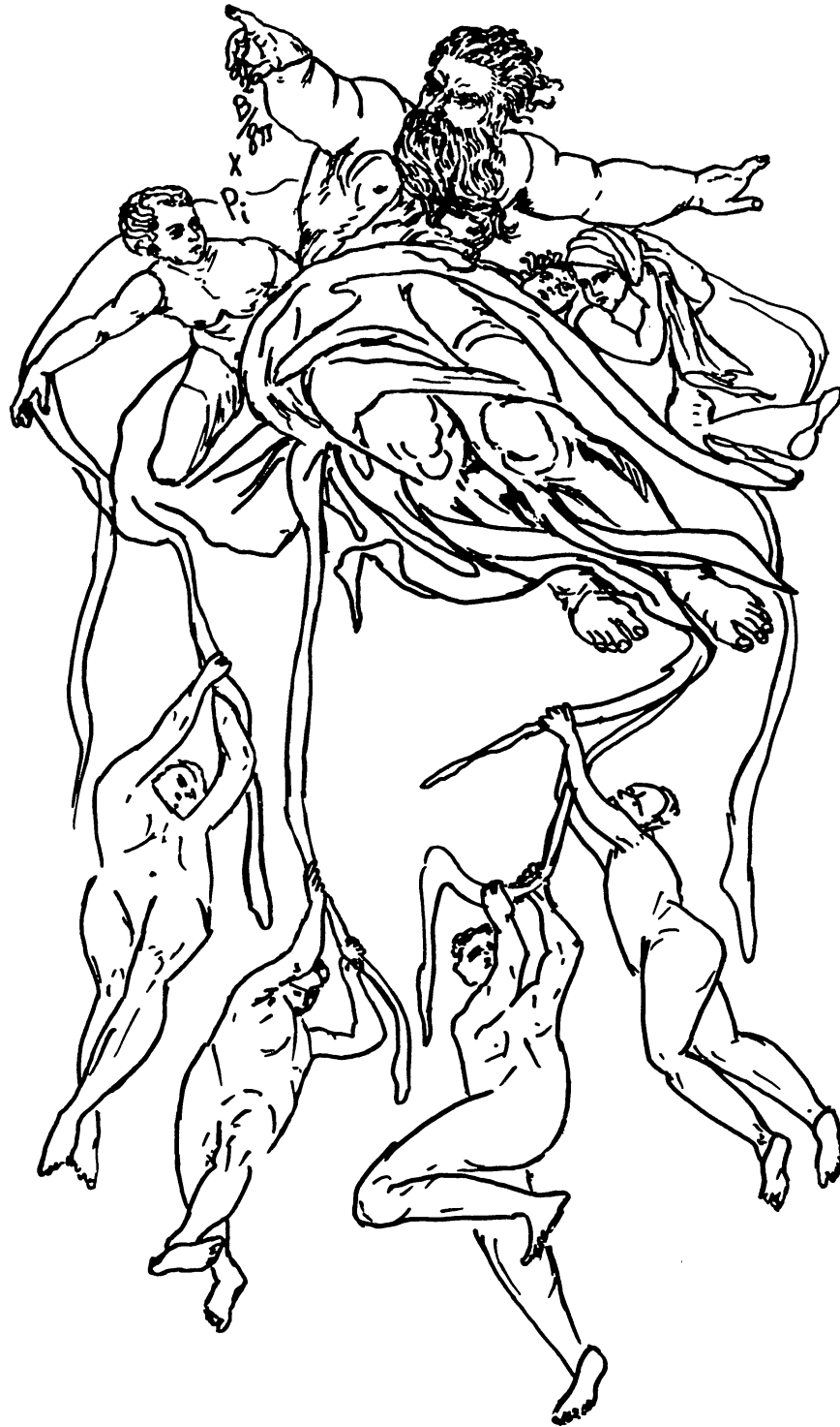
The Principle of Solar Communicativity. There is a benign presence in the Sun gracefully offering magnetostatic fluxtubes to terrestrial astrophysicists to grasp and to hold on to for dear life—illustration by M.P. Ryutova.