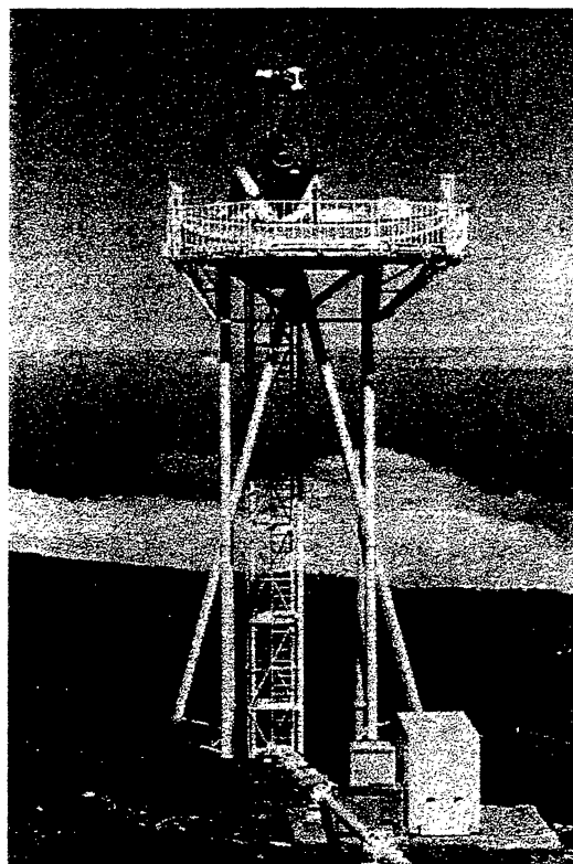
Figure 1: The Dutch Open Telescope on La Palma. The telescope and the 15 m high support tower are open to the trade wind from the North (to the right) which brings the best seeing to La Palma. When it blows sufficiently strong it confines the solar-heated boundary layer of turbulent convection to heights below the telescope and flushes the telescope itself. The parallactic telescope mount is extraordinarily stiff to avoid image shake from wind buffeting. A clamshell foldaway dome protects the telescope from (sometimes very) inclement weather. The telescope consists of a 45 cm parabolic primary (seen in the middle of the photograph) with 200 cm focal length. The primary image is mostly reflected away with a water-cooled mirror (the water storage tank is in the foreground). A small hole (1.6 mm) transmits the field of view. The slender on-axis pipe at the top of the telescope contains the focusing mechanism, re-imaging optics, the G-band filter and the G-band camera. The other four cameras of the multi-channel imaging system will be mounted at the telescope top besides the incoming beam. The speckle frames are transported by optical fibers (in the pipe) to a large-capacity data acquisition system in the Swedish solar telescope building from which the DOT is operated.